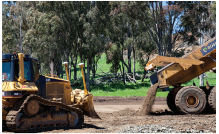
Construction is ongoing at White Rock Wind Farm

The proposed powerline route would run approximately 13 km west from the wind farm site to connect to TransGrid's 330 kV transmission line which runs between Armidale and Dumaresq. The alternative powerline would be the same size and configuration as the original approved powerline, but would be approximately 5 km longer. The permanent physical impact on the ground of the powerline is limited to the foundations for each pole along the powerline route, with concrete poles spaced approximately 200 to 250 m apart. The poles would have a maximum height of 35m. The detailed design for the powerline will be available once finalised.