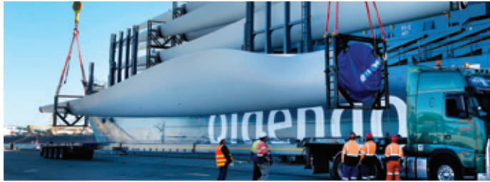
Wind turbine blades, destined for White Rock Wind Farm, being unloaded at the Port of Newcastle. The blades will be stored at Port of Newcastle while technicians prepare them for transportation. Deliveries will commence when the project site is ready to receive them.

White Rock Wind Farm has a comprehensive Traffic and Access Management Plan in place and works closely with the relevant authorities and stakeholders to identify and manage any impacts to local traffic and transport infrastructure arising from the transportation of loads. Please take care when driving in these areas during these times. Please observe all warning and speed restriction signs. If you have any questions or concerns related to the haulage please contact us.